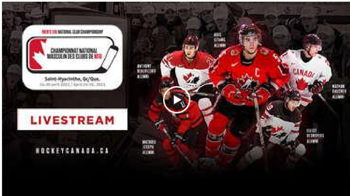
Gaulois de Saint-Hyacinthe (HST) vs. Calgary Flames (PAC) | 2023 MU18 Club Nationals